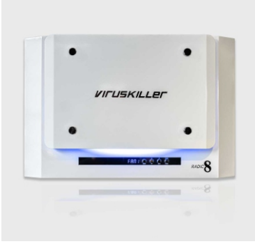
Radic8 - air purification system

Despite the financial impact of the coronavirus, we will not be increasing our normal fees unless absolutely necessary.